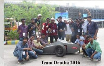
Team Drutha 2016