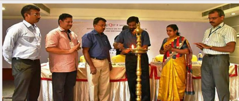
National Conference on Research Innovations in Thermal and Mechanical Engineering

The Career Guidance and Placement Unit (CGPU) of College of Engineering, Adoor is always aiming and working towards providing the best of the training and exposure to the students so that they are well prepared for their forthcoming